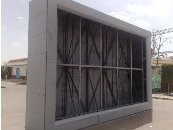
Structure frame with LED cabinet assembling