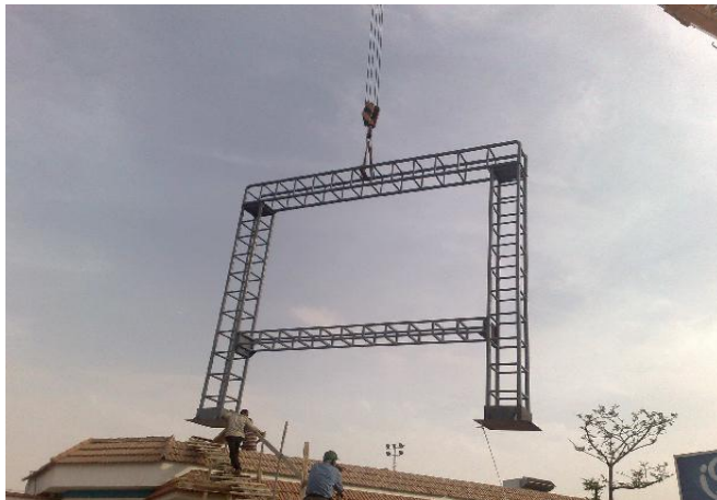
Hanging outer structure up to the roof