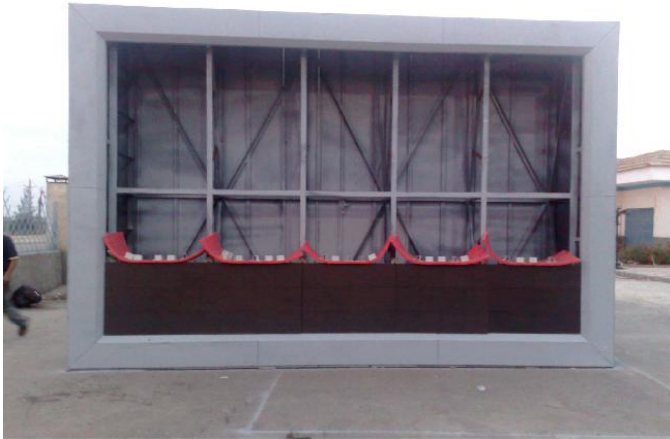
Hanging the LED display up to the roof